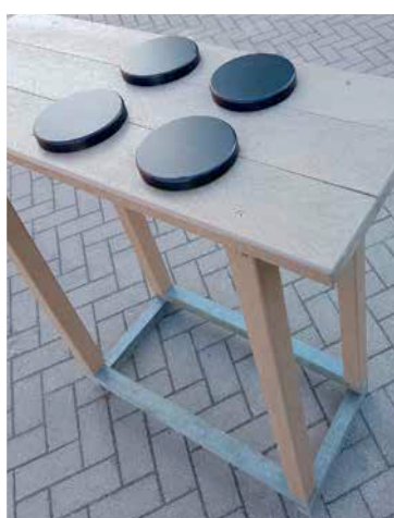
cooking table +/- 38,5 kg