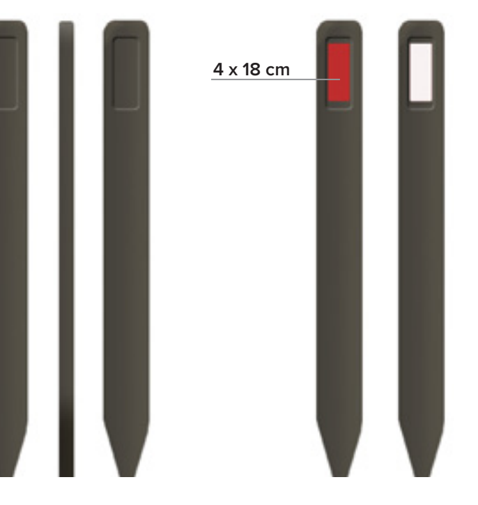
model 1 single sided cut-away