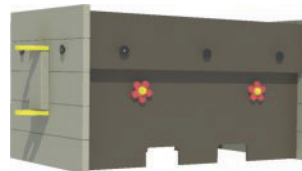
GP36B5 75 cm height +/- 133 kg